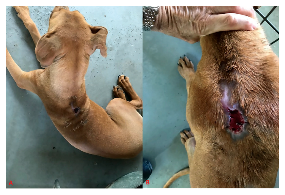
Figure 2: A) Lesion two weeks after initial presentation showing major contraction and reduction in its size. B) Close up view of the same lesion.