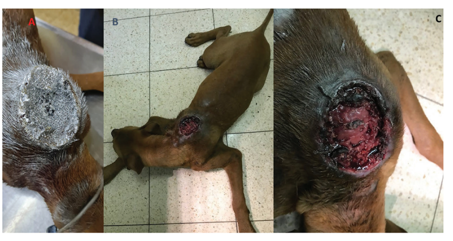
Figure 1: A) The lesion on day of initial presentation with maggot presence. B) The same cutaneous ulcerative lesion after removal of the larvae. C) Close-up view of the same lesion after removal of the maggots.

The dog was administered 500mg cephalexin (Cepharol 500, Teva, Israel) PO BID with food for the next 10 days and the wound was flushed with chlorhexidine twice daily every 12 hours for the first week. The wound underwent complete healing by secondary intention (Figures 2A, B). Healing was completed in four weeks. The larvae were placed in a vial with 70% alcohol and identified according to standard taxonomic keys (1) as the first, second and third instar stages of W. magnifica (Figure 3).